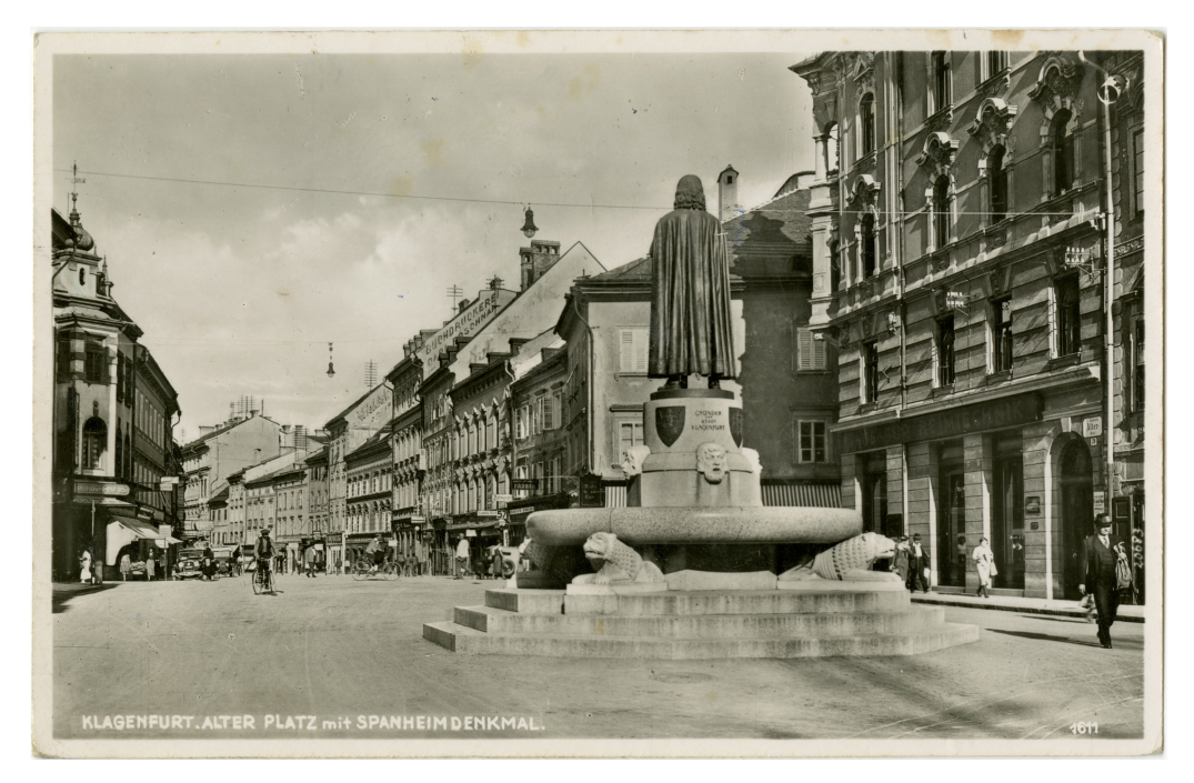
Figure 11. Postcard of Spannheim Monument.