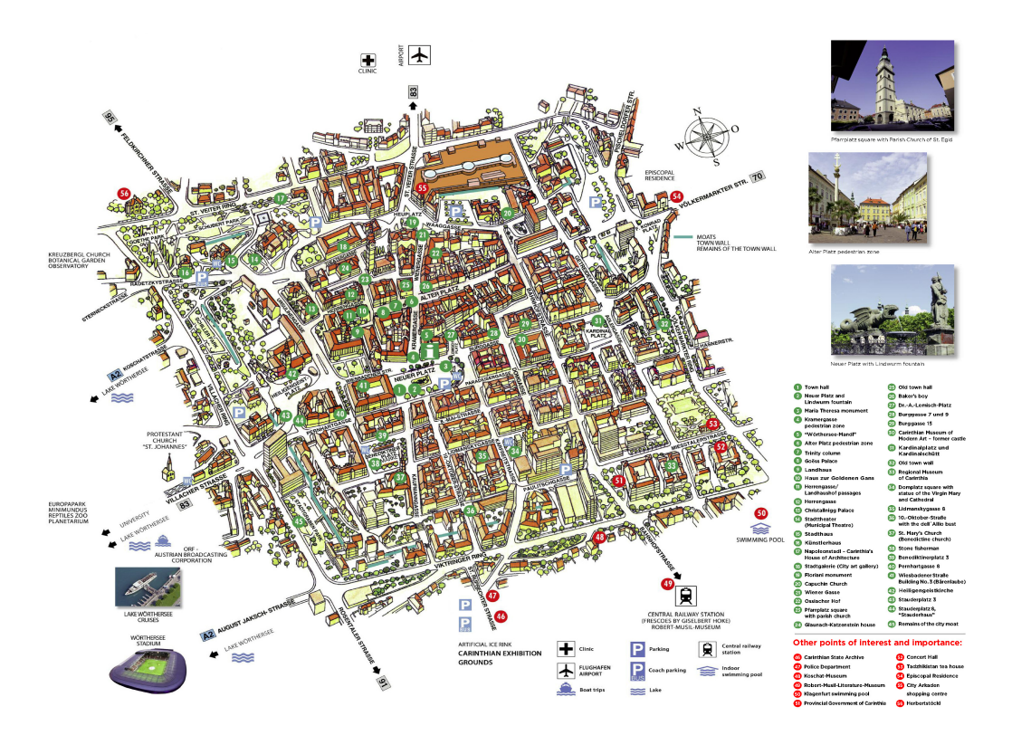
Figure 2. Map from Klagenfurt am Wörthersee Tourism Region's brochure, "A Walk through the Old Town."

It is just one of many changes for the column, which received its half moon and cross in 1683 to mark the Austrian victory over the Ottomans in battle, a second plague from which the town was spared (Figure 7). In its new place, instead of invoking God for sparing the town from these plagues, it evokes a generic sense of history, an aesthetic of age that puts it in dialogue with the square it pins down. Tourists (and locals), after all, don't want to shop and take coffee amid reminders of plague—and the Pestsaüle in its new position poses no such threat. It can take its rest as a beautiful, vertical ornament imported as scenery. It may be seen as an urban form of repoussoir, the painterly technique that plants a formal element, often a building or tree, in the foreground of an image in order to frame and give measure to the middle and background. It is a compositional strategy that leads the eye into a scene. From the crossroads of the Alter Platz, the column gives a spatial gauge to the "new old" area—whether or not Klagenfurt's urban planners were aware of such pictorial effects.