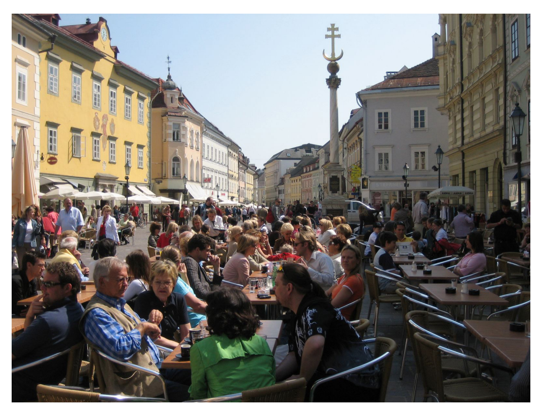
Figure 1. Plague column, Klagenfurt, 1680.