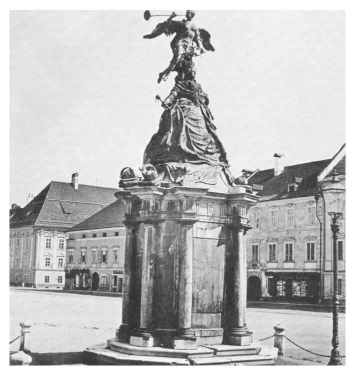
Figure 9. Original statue of Maria Theresia, 1765, from Siegfried Hartwagner, Klagenfurt, Stadt: Ihre Kunstwerke, historischen Lebens-un Siedlungformen (Salzburg: Verlag St. Peter, 1980), 166.

craft shops, boutiques and antique stores, cafés and restaurants, most closing outside of shopping hours.<sup>6</sup>