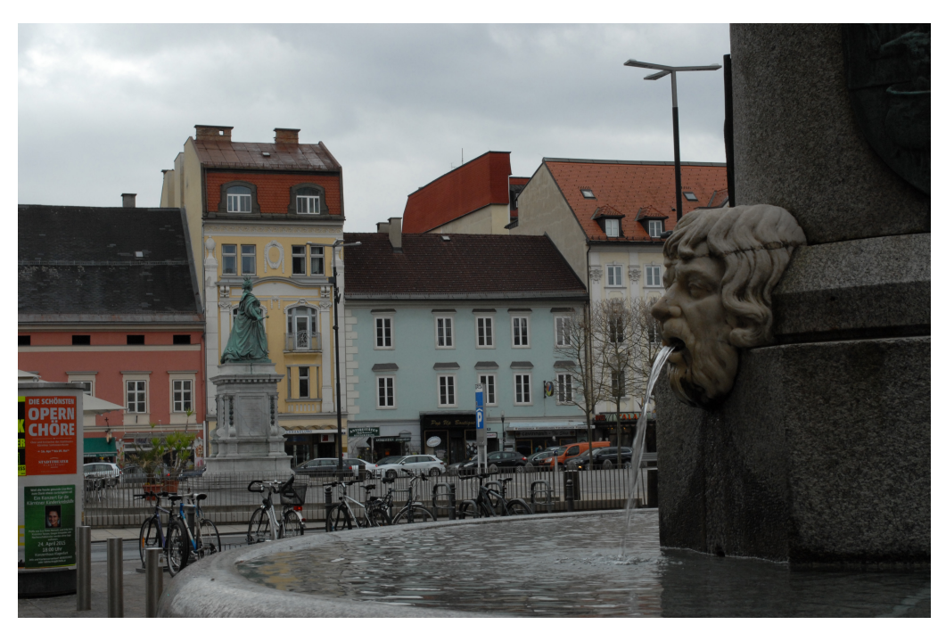
Figure 12. View of Maria Theresia from Spannheim Monument.

period—a Viennese publishing house reprinted the third edition in 1965, just as Klagenfurt refashioned its historic core. <sup>15</sup> Sitte was also a seminal figure in redeeming the medieval town and forging a counterargument against Haussmannesque destruction. <sup>16</sup> What would Sitte have thought of Klagefurt's playful use of monuments? <sup>17</sup> While he may have frowned upon displacing the column so casually, he would have recognized