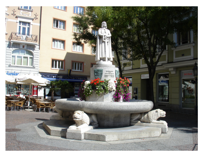
Figure 10. Bernhard of Spannheim Monument, Lemisch Platz, Klagenfurt, 1954.

conservation widened to include neighborhoods or districts, and a form of conservation zoning emerged, formalized in the idea of the zone protégé , a term coined in 1962, the same year that Klagenfurt pedestrianized its historic area. <sup>11</sup> Klagenfurt's planners, who seemed hopelessly backward in 1954 with the Spanheim monument, were in step with the vanguard by the early 1960s. Or perhaps they moved in two directions at once.