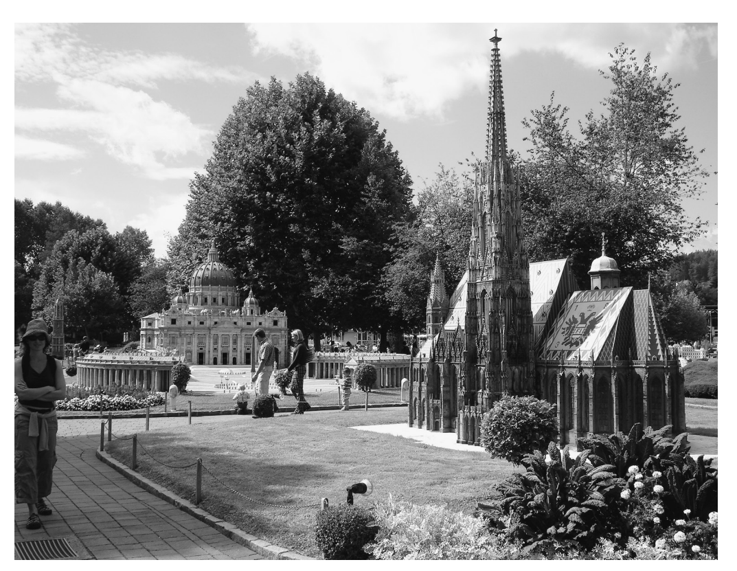
Figure 13. View of Minimundus, Klagenfurt.

ments of its old city, as moveable props in a game of urban theater. The combination of close, archaeological reconstruction of the monuments alongside the extraordinarily liberal grouping suggests that Minimundus and Klagenfurt's historical core share a similar ethos. In both cases, the high fidelity of detail obscures the quiet deceit of the ensemble.