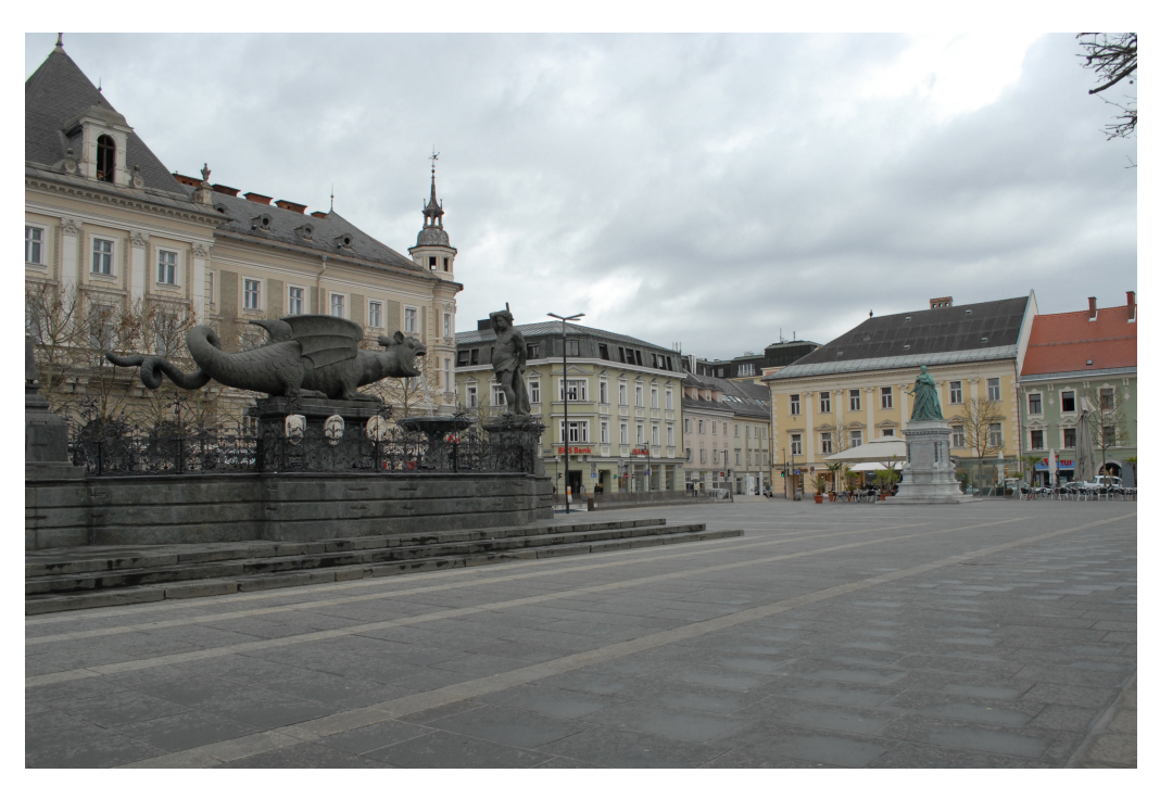
Figure 8. Lindwurm, 1593, and statue of Maria Theresia, 1870.

to do just that—than they nod generically to history. In fact, relieved of the burden of specific commemorative practices, they are free to adorn, mark space, or, as an ensemble, demarcate and ennoble the old city, in effect, to affirm its historicity in another pivotal moment of transformation.